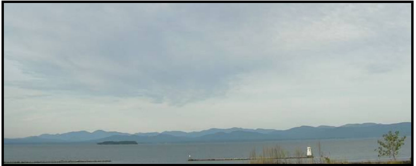
Western view from the fourth floor of the Moran Center

For Relocation and Business Information please refer to: www.cedoburlington.org/business/doing_business_in_burlington/dbb_toc.htm