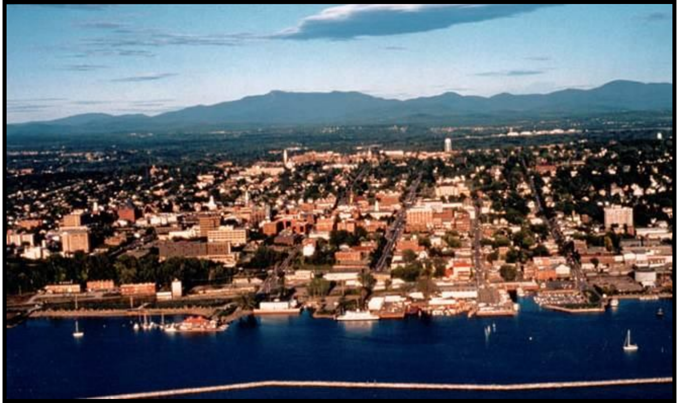
The Moran Center project is located in Burlington's downtown waterfront