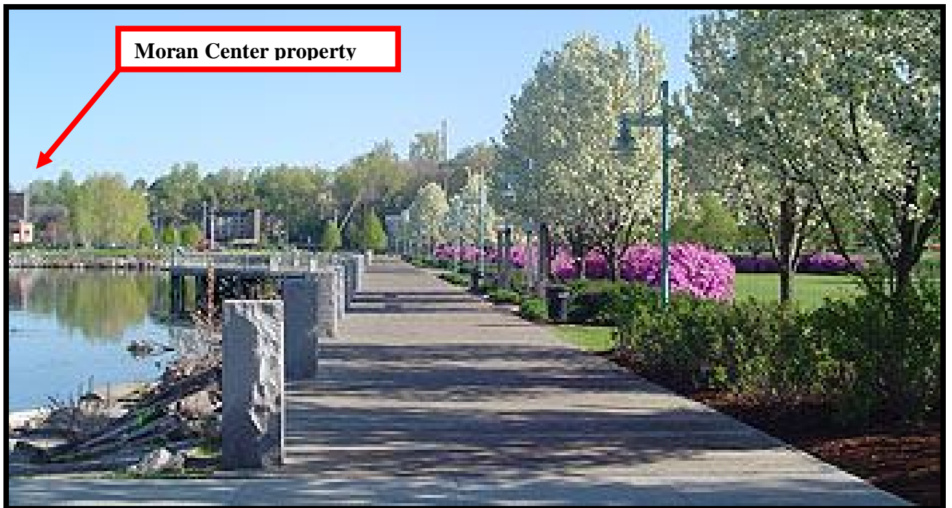
The Moran property is adjacent to Waterfront Park